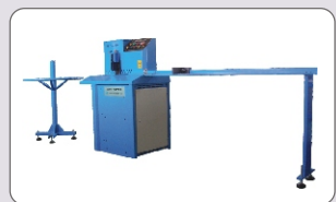
Cutting m/c Set