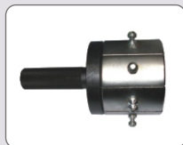
Quick Change Tool