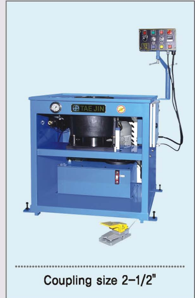
Coupling size 2-1/2"