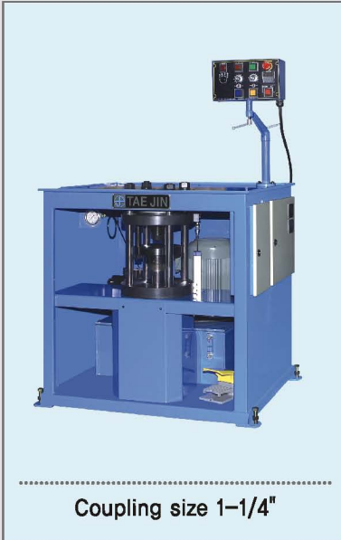
Coupling size 1-1/4"