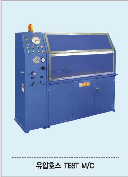
유압호스 TEST M/C