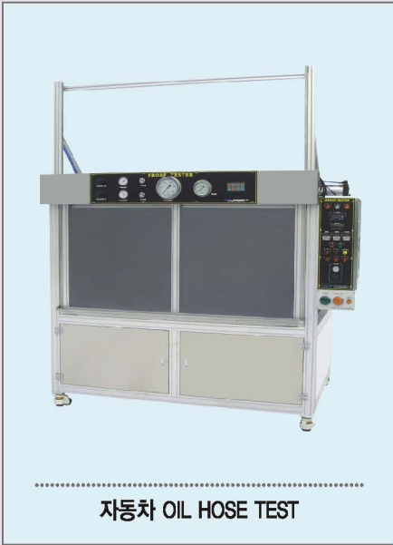
자동차 OIL HOSE TEST