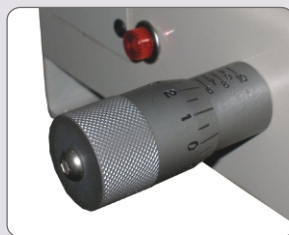
Control Micro Dial